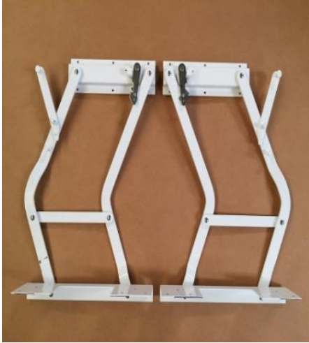
2 Lift Arms